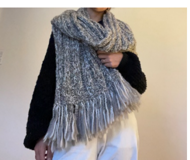
Knitters - we can always use more shawls.